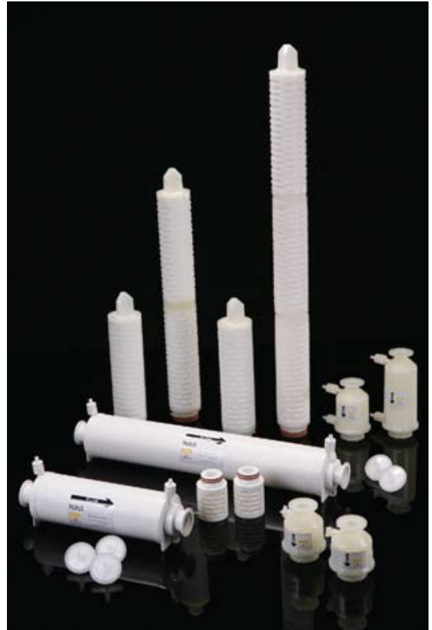
Note: PROCLEAR and DEMICAP are registered trademarks of Parker domnick hunter