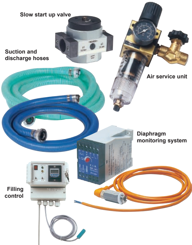
Slow start up valve

The pumps can be equipped with mechanical and electronic switching equipment, sensors, early warning systems, heating, dosing and filter press controls for monitoring purposes, open loop and closed loop control.