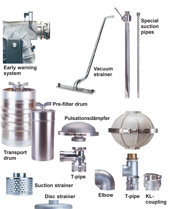
Special suction pipes