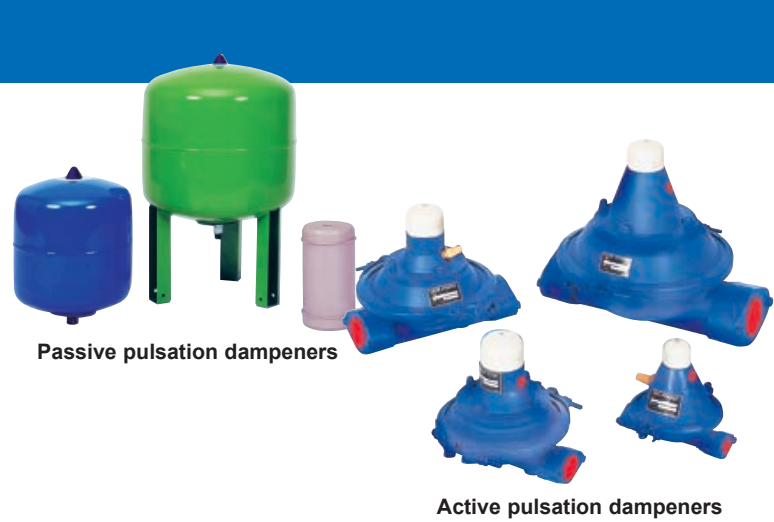
Passive pulsation dampeners